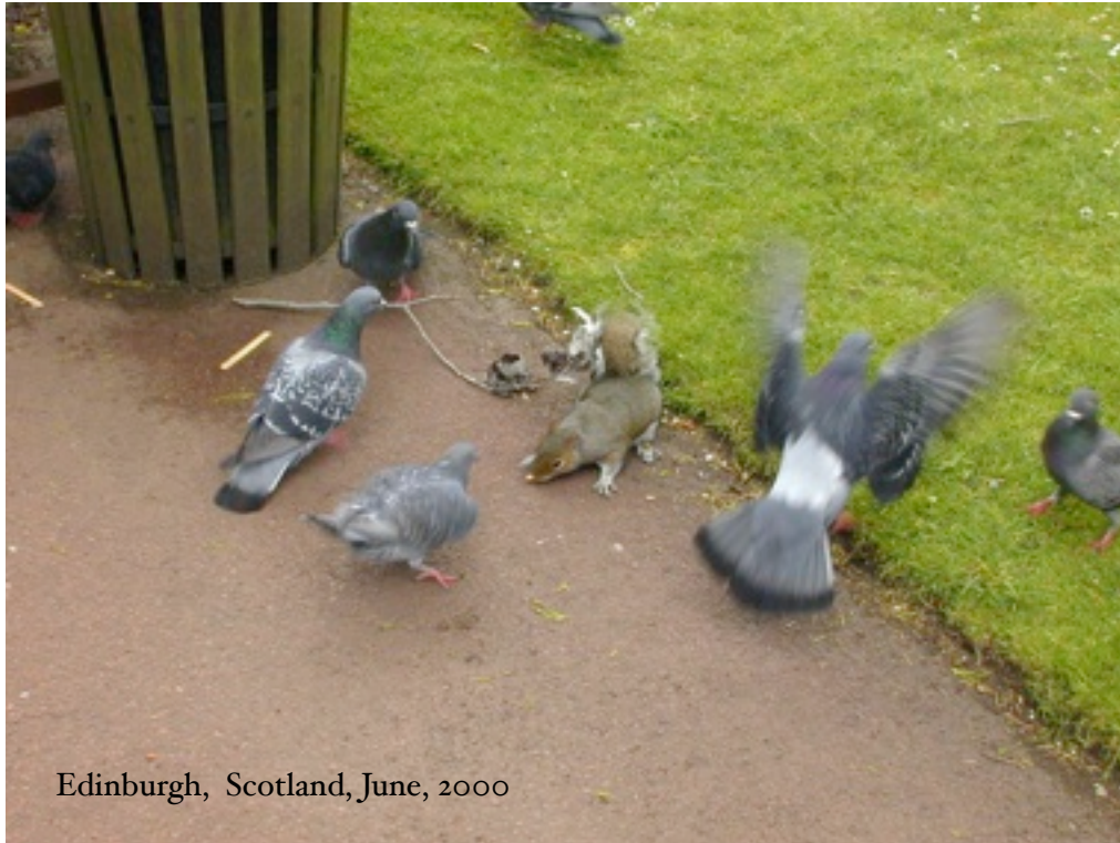
Edinburgh, Scotland, June, 2000