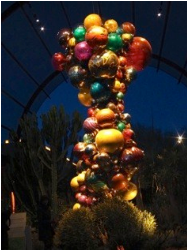
Chihuli Christmas Balls, 2013