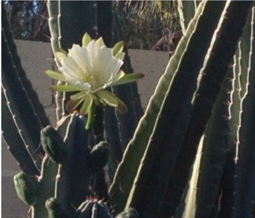
Night blooming cereus, Phoenix 2013

We're in a free fall into future. We don't know where we are going. Things are changing so fast and always, when you are going through a long tunnel, anxiety comes along. And all you have to do to transform your hell into a paradise, is to turn your fall into a voluntary act: joyful participation in sorrow and everything changes. Joseph Campbell