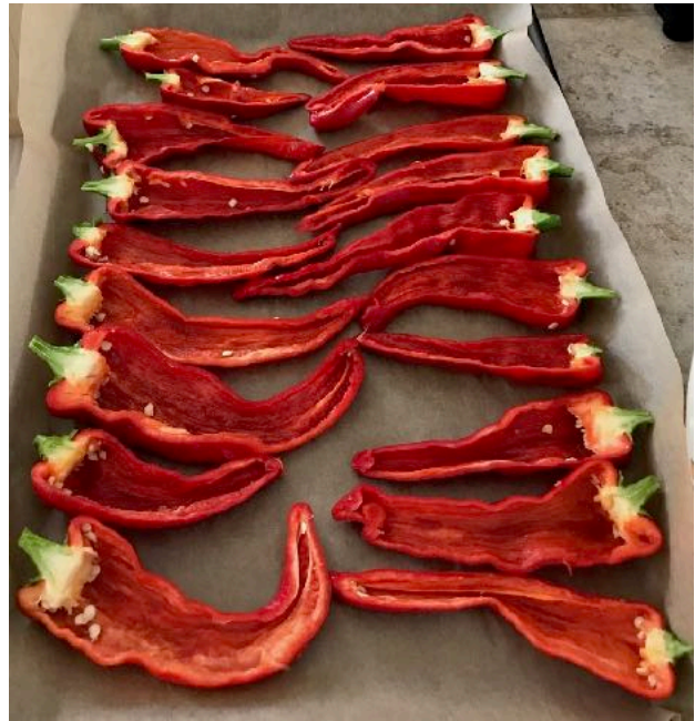
Hot summer in Santa Fe!

too, but it's a great challenge to stay current with all the new technologies.